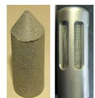
Art. No. : 111 8959 / 111 8960