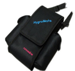
Art. No. : 111 8957